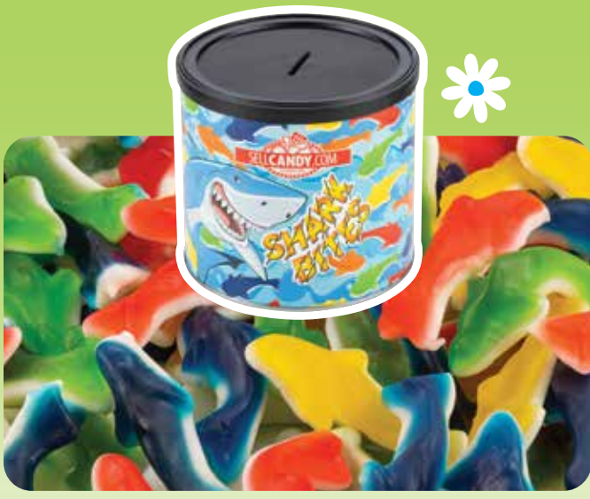
1004 • Shark Bites • $13

Colorful two-layered gummy sharks with white bellies.