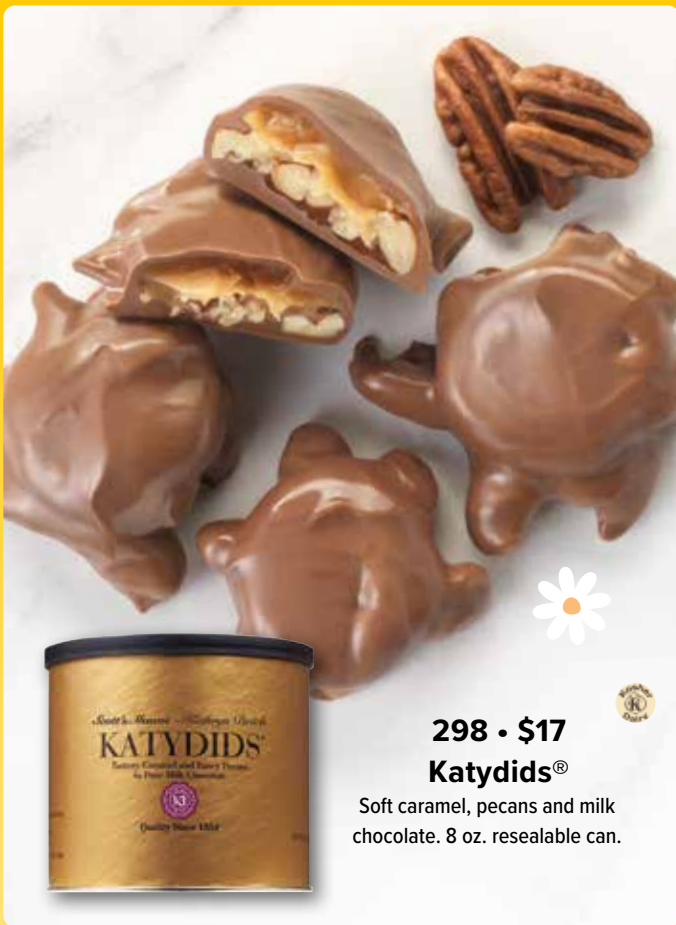
298 • $17 Katydid®

Chewy gummy worms that start off sour then turn sweet.