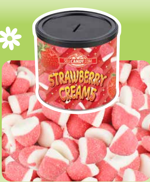
1006 • Strawberry Creams • $13

Gummy chewy goodness with a sweet peach fruity flavor.