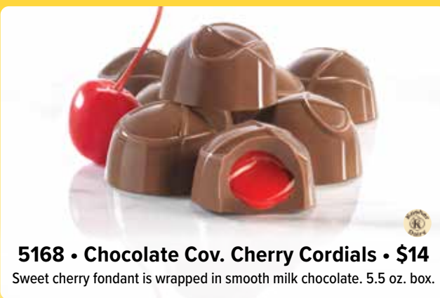
5168 • Chocolate Cov. Cherry Cordials • $14

Cashew pieces covered in caramel and milk chocolate. 7 oz. box.