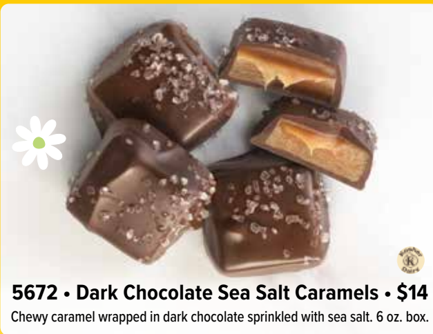
5672 • Dark Chocolate Sea Salt Caramels • $14

Soft caramel, pecans and milk chocolate. 8 oz. resealable can.