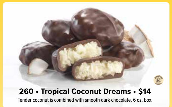
260 • Tropical Coconut Dreams • $14

Sweet cherry fondant is wrapped in smooth milk chocolate. 5.5 oz. box.