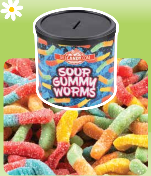
1002 • Sour Gummy Worms • $13

Yummy strawberry gummy atop a pillow of marshmallow.