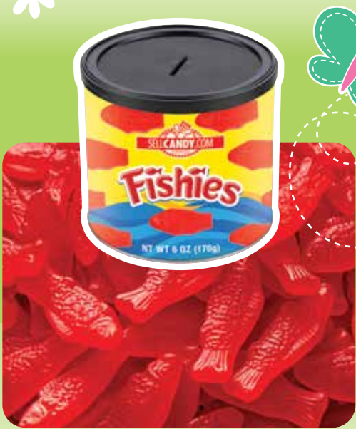
1007 • Fishies • $13

Fruit flavored gummy bears are an all-time favorite.