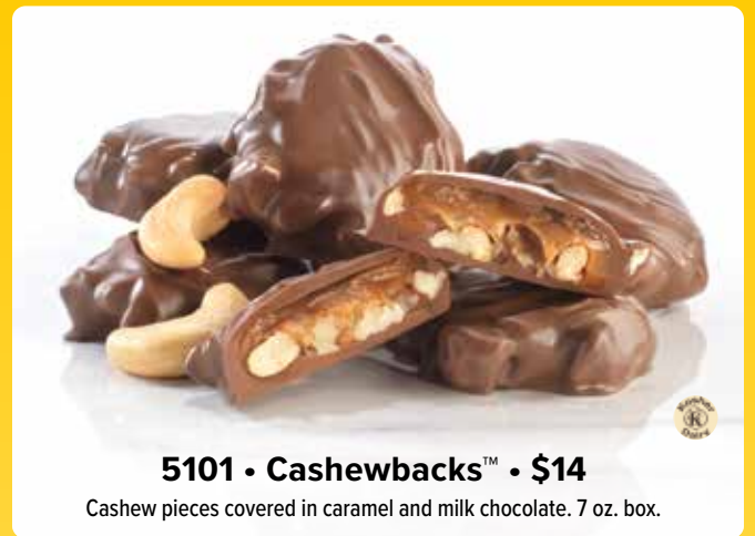
5101 • Cashewbacks™ • $14

Chewy caramel wrapped in dark chocolate sprinkled with sea salt. 6 oz. box.