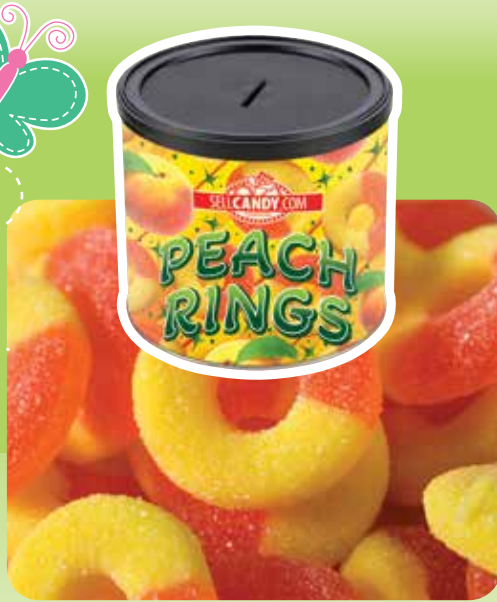
1005 • Peach Rings • $13

Chewy and fruity cute red fish shaped gummy candy.