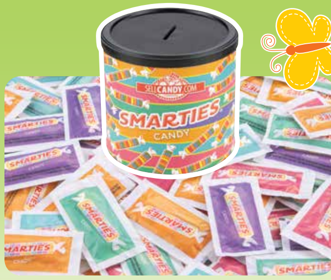
1003 • Smarties® Candy • $13

Colorful two-layered gummy sharks with white bellies.