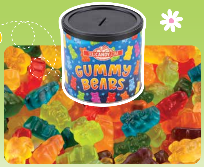
1001 • Gummy Bears • $13

Classic Smarties® candy tablets in tasty colors and flavors.